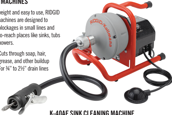
K-40AF SINK CLEANING MACHINE MSC #60922457 RTC #71722