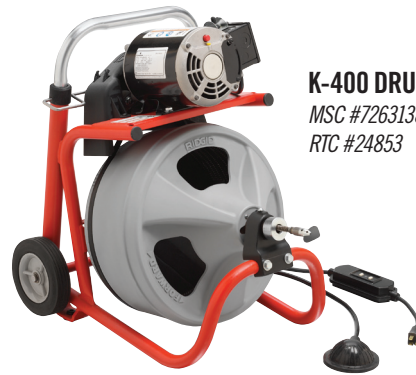
K-400 DRUM MACHINE MSC #72631385 RTC #24853