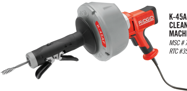
K-45AF SINK CLEANING MACHINE MSC # 77636777 RTC #35743