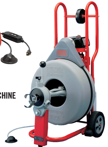
K-750 DRUM MACHINE MSC #74788092 RTC #42007