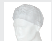
Hairnets & Beard Covers