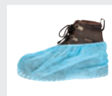
Shoe & Boot Covers