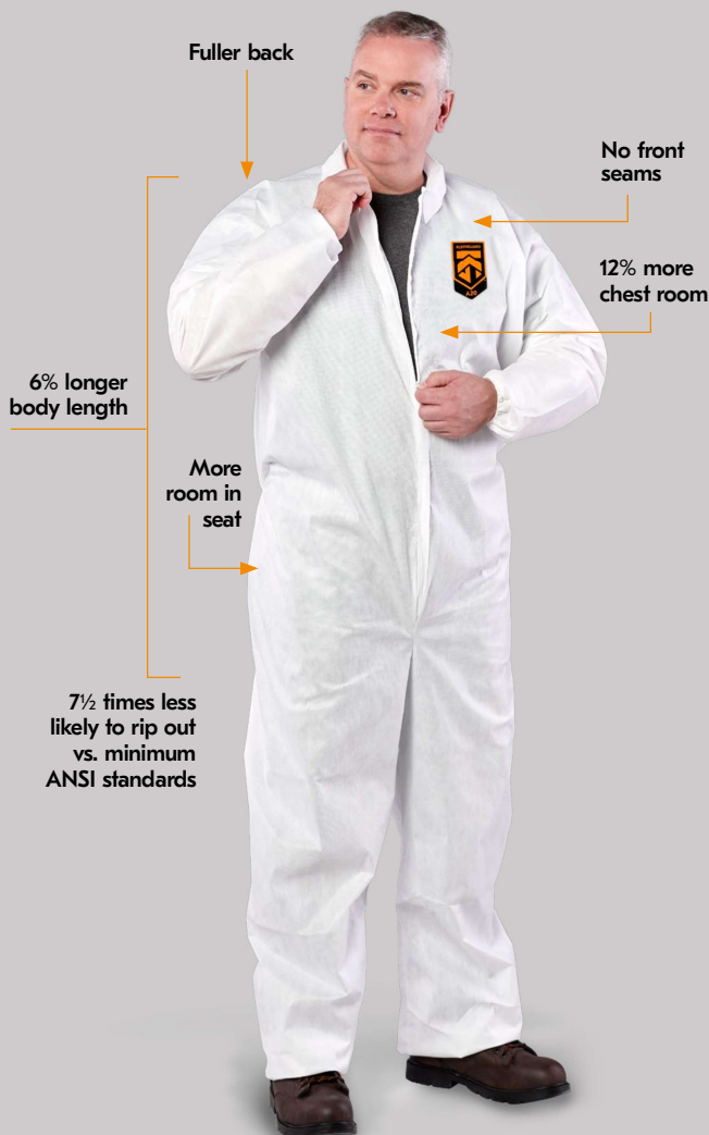
KleenGuard™ Coverall with Reflex® Design (Available in A20, A30, A40, A45, A60, A70 and A80 Coveralls)