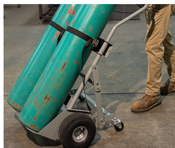
Gas Cylinder Handling