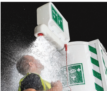
Emergency Eye/Face Wash & Safety Showers