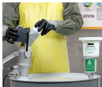
Aerosol Can Recycling