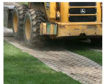
Ground Protection Matting