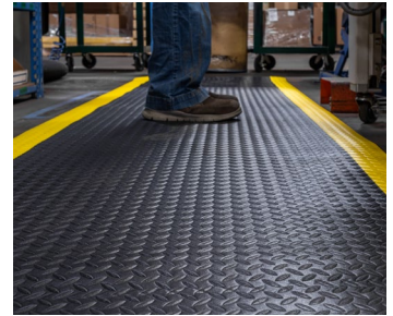
Industrial Safety Matting