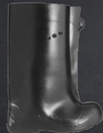
15" - JD1022