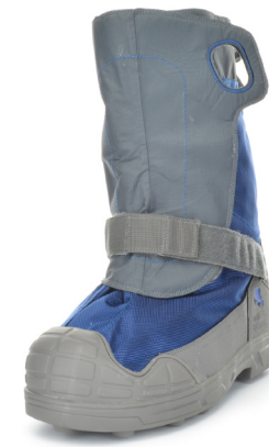
ICEGRIPS OVERSHOE® 14" MODEL: JD6472