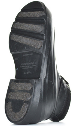
GRIPS® MODEL: JD912 JD922 JD1022