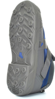
ICEGRIPS OVERSHOE® 6" MODEL: JD5472