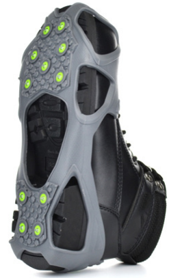
EASY-SPIKE™ MODEL: JD350