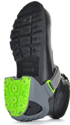
HEEL-GRIPS™ MODEL: JD325