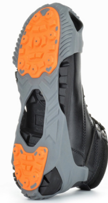
LOW-PRO® ICE CLEATS MODEL: JD6610