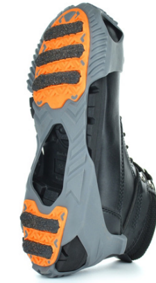
GRIPS-LITE® MODEL: JD6612