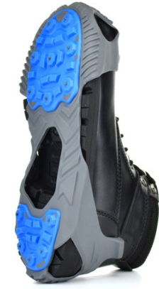
HIGH-PRO® ICE CLEATS MODEL: JD6625