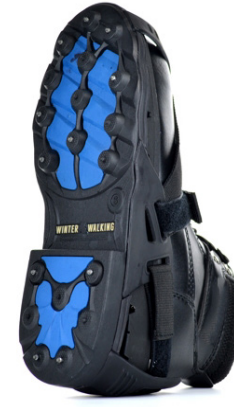
ICE GRIPS® MODEL: JD4472