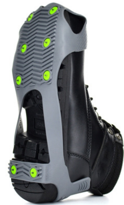
SPARE-SPIKE® MODEL: JD510