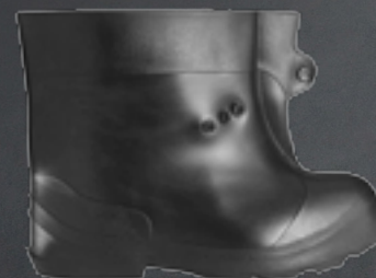
10" - JD922