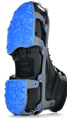
ICE BEAST™ MODEL: JD7725