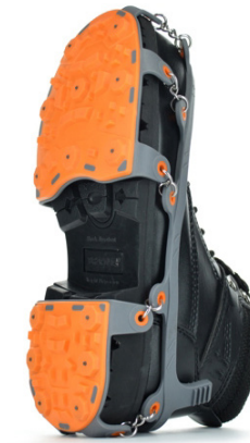
ICE BEAST™ LOW-PRO MODEL: JD7710