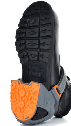
LOW-PRO® HEEL MODEL: JD310