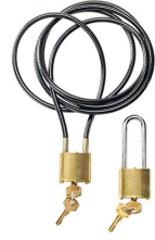
CL2 Cable Lock (2 pack)