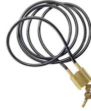
CL1 Cable Lock