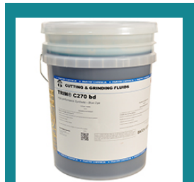
5-gallon pail SKU: C270BD/5 UPC-12: 641238001300