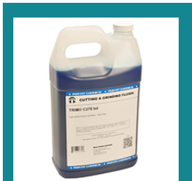
1-gallon jug SKU: C270BD/1 UPC-12: 641238066743