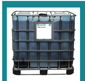
270-gallon tote SKU: C270BD/NR270P UPC-12: 641238034018