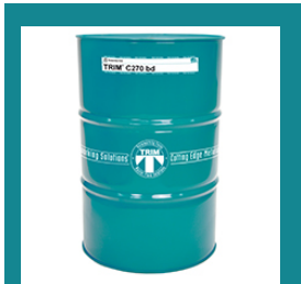
54-gallon drum SKU: C270BD/54 UPC-12: 641238001317