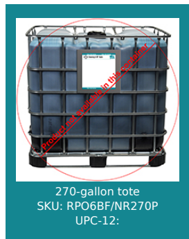
270-gallon tote SKU: RPO6BF/NR270P UPC-12: