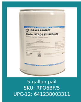
5-gallon pail SKU: RPO6BF/5 UPC-12: 641238003311