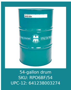
54-gallon drum SKU: RPO6BF/54 UPC-12: 641238003274