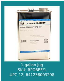
1-gallon jug SKU: RPO6BF/1 UPC-12: 641238003298