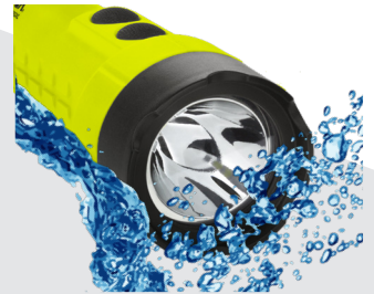
Durable polymer body is impact & chemical resistant