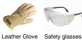
Leather Glove Safety glasses