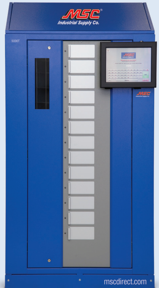
Stand alone unit shown.