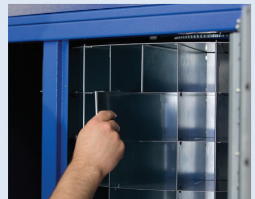
Removable dividers allow for 3" or 6" wide compartment.